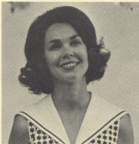
JULIE NIXON EISENHOWER