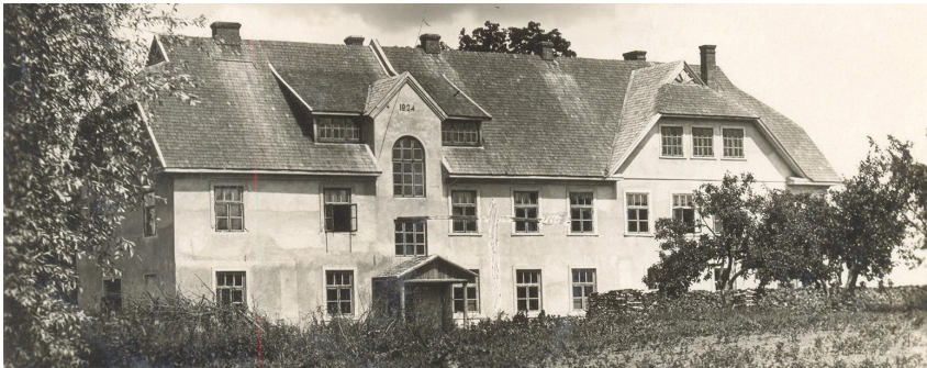
Figure 3. Ļaudona Agriculture School 1930s [11].

elementary school was destroyed. In autumn, a seven-year elementary school started functioning in the premises of the former agriculture school. Soon it was transformed into a secondary school with 11 classes. At the time the number of students was over 200 instead of previous 60. The school had 11 classrooms, a combined physics and chemistry cabinet, a gym where exercises were run from time to time, a pioneer room, a teachers' room, and a flat in the attic space. In this building, the school continued its work until 1977, when a new secondary school building was built next to it. Since then, the building designed by Blankenburgs has not been unused [12].