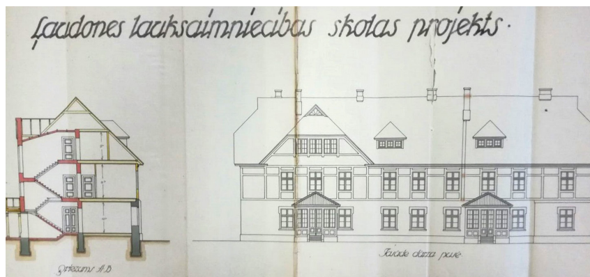
Figure 1. Project of Ļaudona Agriculture School building [8].

Ļaudona Two-Year Agriculture School Building Designed by Architect Indriķis Blankenburgs