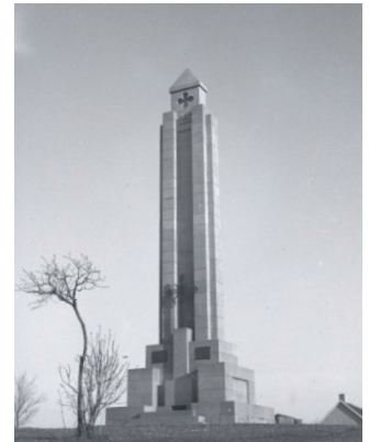
Figure 6. The Šiauliai Monument of Independence on the Hill of Rebels [36].

These final events left deep traces in the memory of people. The idea of installing a monument on the Hill of Rebels has already occurred in the first years of Lithuania's independence. In 1927, the place and the foundation stone of the monument were consecrated, with the participation of the President of the State Antanas Smetona (1874–1944) [37]. Initially, the project for the construction of the monument was commissioned to sculptor Juozas Zikaras (1881–1944). The sculptor made a