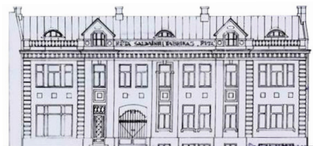
Figure 4. Project of Šiauliai chocolate factory « Rūta » (1927) [32].

The candy factory « Birutė » at 14 Stoties Street was also built in the so-called «brick style» (1925). In this two-storey building it was planned to have not only manufacturing premises, but also administration offices and a shop, and on the second floor an apartment for the factory director Vladas Vaitkus . After the war, the factory was reconstructed into an apartment building. Though it still reminds the K. Reisonas ' project, its overall view is badly damaged – on the ground floor there are various companies, their owners decorate the facade of the building, each according to their own understanding, without coordinating their actions with the city artist.