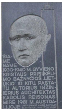
Figure 10. Memorial plaque to K. Reisonas in the Kaunas city (arh. L. Strjoga ) [43].

Not only the buildings and drawings that have survived to this day, but also the memorial plaques, which were erected in Kaunas and Šiauliai cities, show and remind of K. Reisonas' life and work. His works are mentioned in the history of architecture, at photo exhibitions, seminars and conferences. Exhaustive information and visual material on valuable architectural buildings are available in the database of the Register of Immovable Cultural Valuables of the Republic of Lithuania.