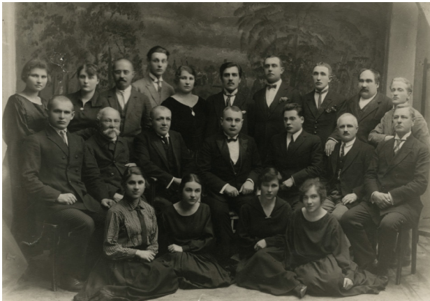
Figure 2. Employees of the Šiauliai city Municipality [22].