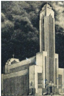
Figure 7. The Christ's Resurrection Church in Kaunas [39].