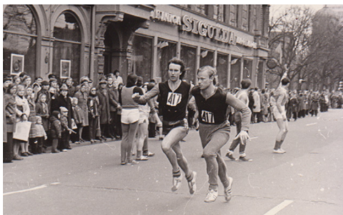
Figure 15. RPI students' traditional relay race on 2 May in Riga (1972).