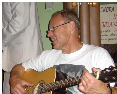
Figure 27. Celebrating the 60th anniversary at home in Saulkrasti (2008).