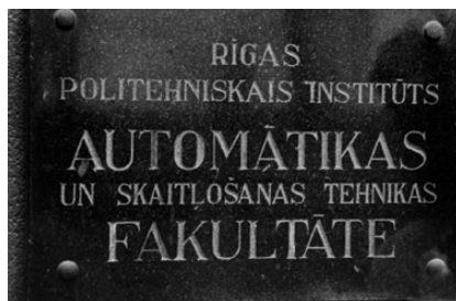
Figure 6. Plate at the entrance to RPI FACT in Riga, 9 Ausekļa Street (1982).