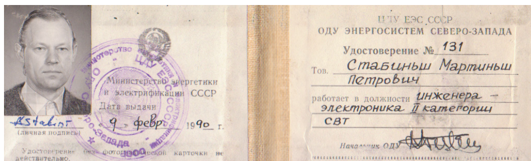
Figure 23. Identification card of Engineer of the USSR Northwest Energy Systems Joint Dispatcher Administration (1990).