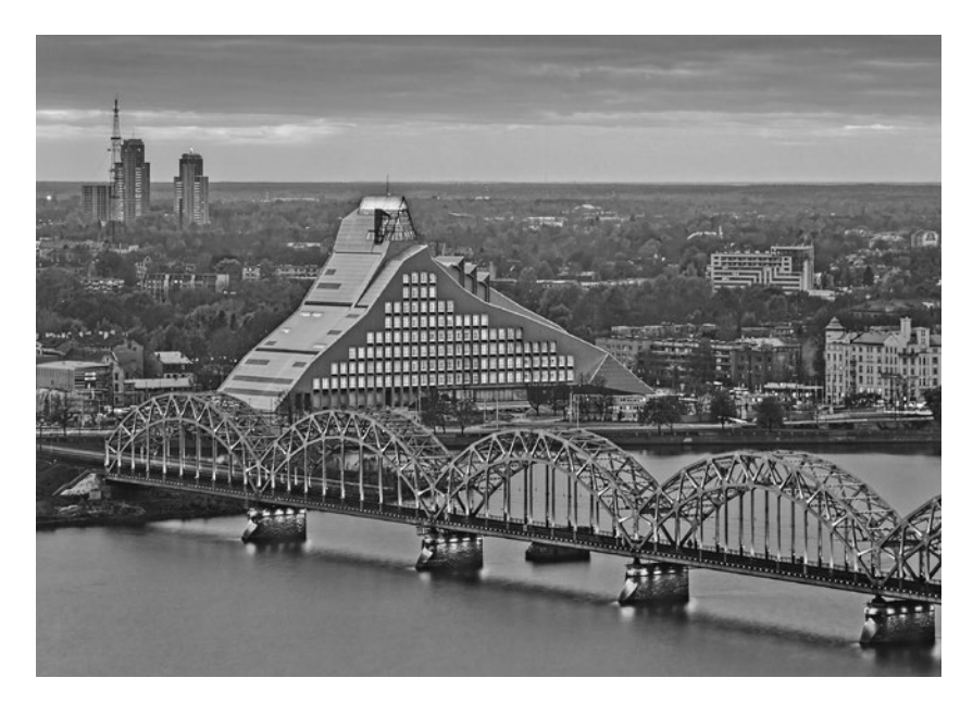
Figure 1: The Castle of Light

four-storey technical facility which contains cooling systems for the Castle of Light, server rooms and some offices.