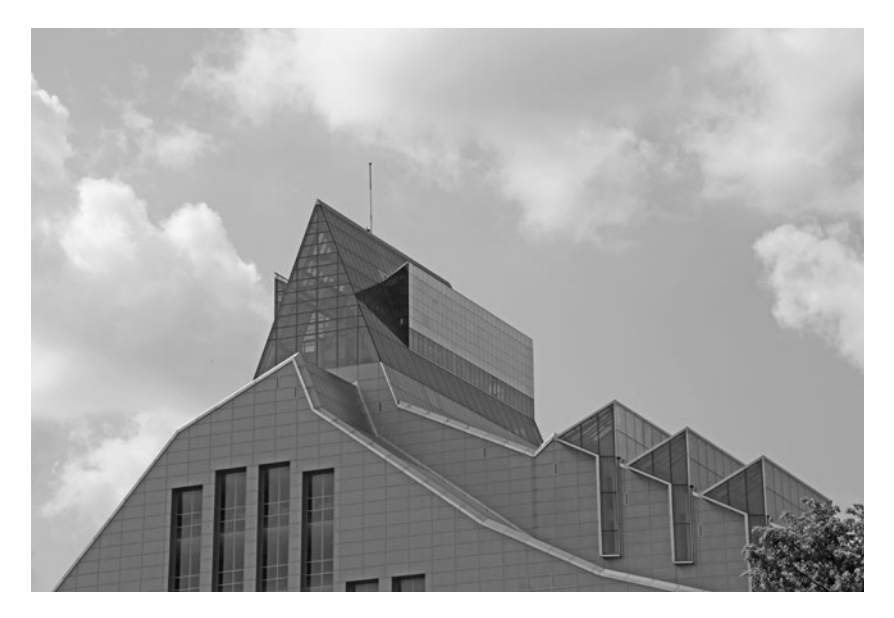
Figure 2: Detail of the façade