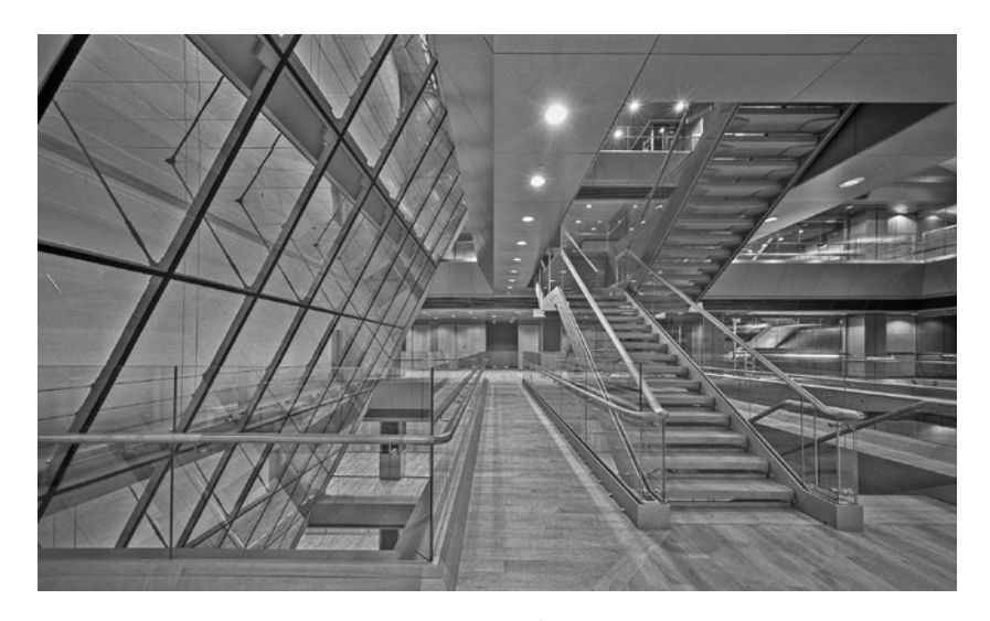
Figure 4: Central staircase