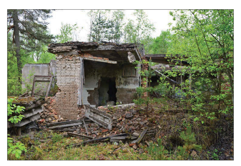
Figure 2. Post-Soviet military base in the Mārciena forest. Photograph by Dagnosław Demski 2015.