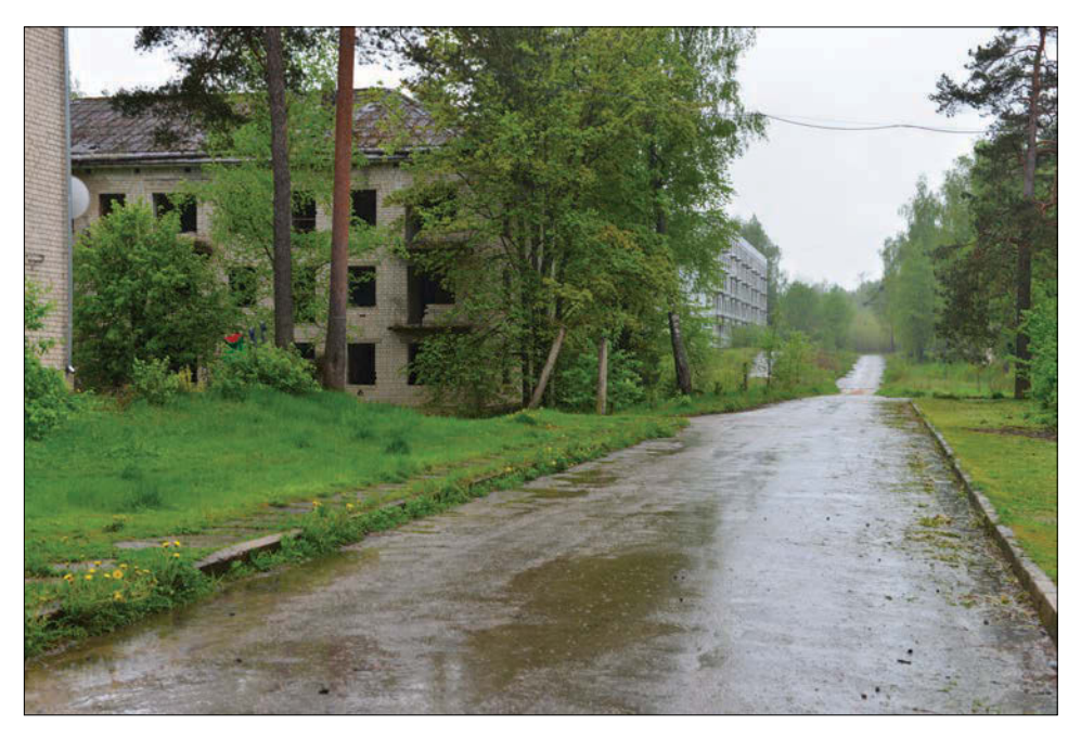
Figure 3. The left side of Meža Street in Mārciena (former Mārciena 2).