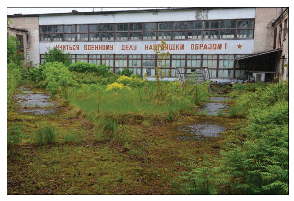
Figure 1. Post-Soviet military base in the Mārciena forest. The slogan on the wall, "To learn the art of war properly!", is a quote from a 1918 speech by V. I. Lenin.

The former residential area of the family members of the military personnel experienced large changes in population<sup>13</sup> triggered by coincidence and the practice of sending to Mārciena "unfavourable" families from all of the parishes of Madona County,<sup>14</sup> a plan developed by the Madona County government. These new inhabitants are believed to have had a disruptive impact on the condition of the surrounding buildings: windows broken, wooden parts removed and used as firewood, etc. As was stated by the current head of the municipal government, migration and changes in the population were huge at that time, and social problems still partially remain (Figs. 3 and 4).