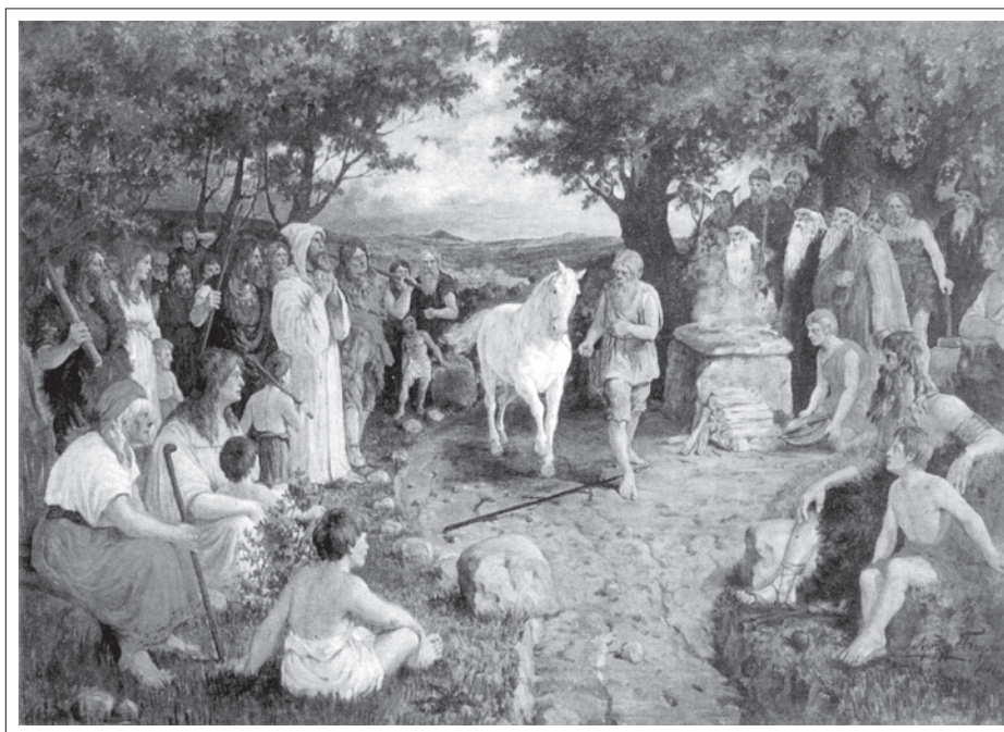
Fig. 2. Painting by A. Baumanis (1867–1904) „The Horse of Destiny” Oil, canvas, 1887.