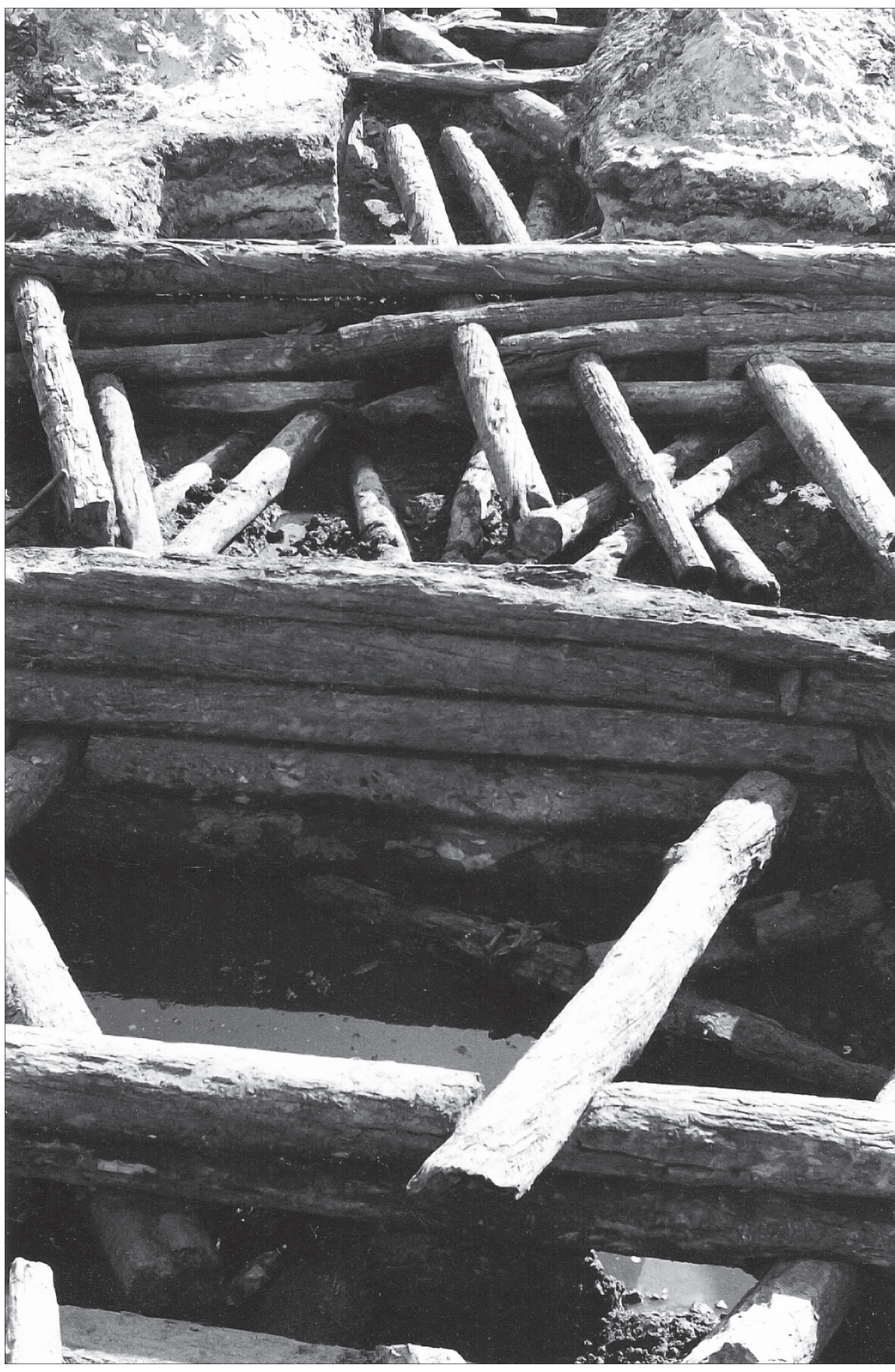
Fig. 2. A view of the stretches of right-bank revetments of the Daugava uncovered in 2000.