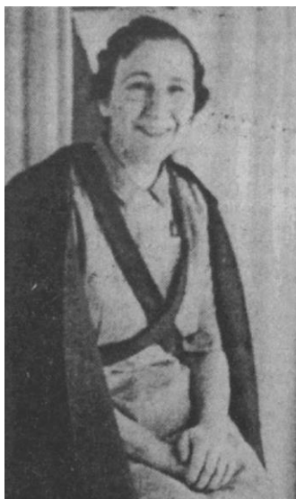
Fig. 4. Helēna Grauda (1899–1990)