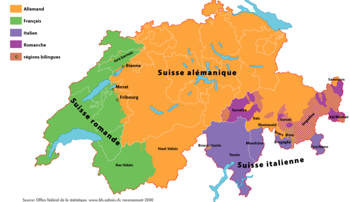
Répartition géographique des langues officielles en Suisse (2000)